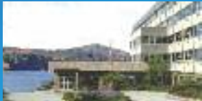
SKY VIEW Rehabilitation & Healthcare 1280 Albany Post Road Croton-on Hudson, NY 10520 www.skyviewrehab.com