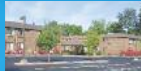
MIDDLETOWN PARK Rehabilitation & Healthcare Center 121 Dunning Road Middletown, NY 10940 www.parkmanorrehab.com