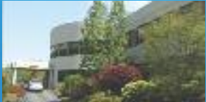
WATERVIEW HILLS Rehabilitation & Healthcare 537 Route 22, Purdys, NY 10578 www.waterviewhills.com