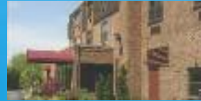
SALEM HILLS Rehabilitation & Healthcare 539 Route 22, Purdy's, NY 10578 www.waterviewhills.com